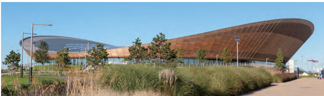
▲ 位於倫敦奧林匹克公園的室內自行車館，也是採用「雙曲拋物面」的幾何設計 The velodrome cycling arena located in the London Olympic Park also adopts 'hyperbolic paraboloid' in its design

數學家認為數學是萬物之本。柏拉圖深信幾何多面體是宇宙的根源，在1600年，有德國天文學家以「柏拉圖多面體」精密地推算行星與太陽之間的距離。區教授說：「連薯片本身都有數學原理，它一面彎曲向上，相反的那面彎曲向下，我們稱之為『雙曲拋物面』。因為它雙重彎曲，有助於平衡物件的張力和壓力，任何一處受壓，都可以把壓力傳遞至四周，所以薯片雖然薄，卻有令人意想不到的強度。」建築界亦巧妙地應用薯片的幾何原理，讓建築物可以把重量分散，這些重量最終會傳遞到地面。區教授鼓勵學生多觀察身邊事物，便能體會數學天地之無垠。