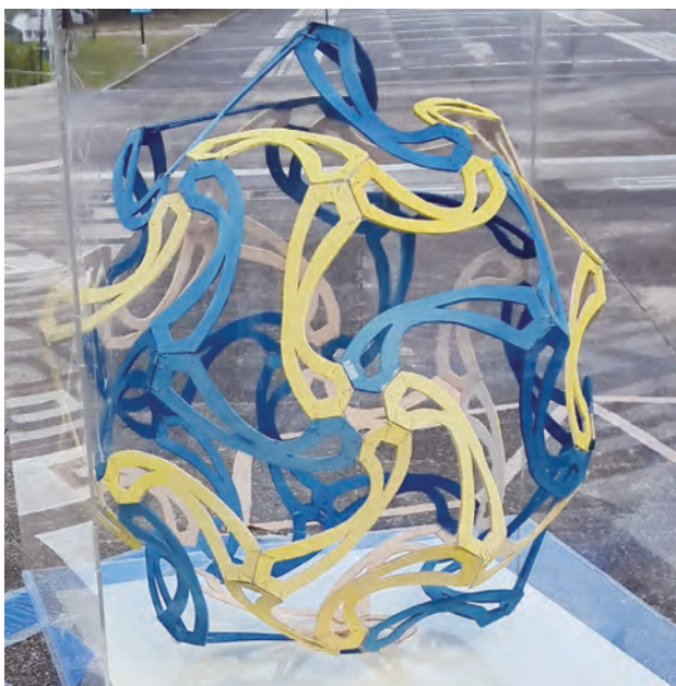
▲ 五角化六十面體 Pentagonal hexcontahedron