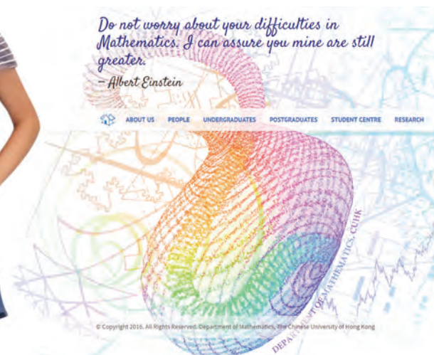
▲ 她為數學系網頁繪製的「克萊因瓶」 The Klein bottle she illustrated for the department's website