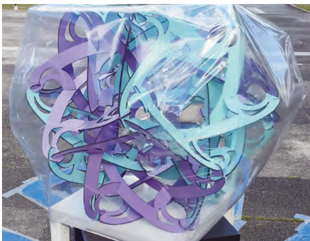
▲ 菱形六十面體 Rhombic hexcontahedron