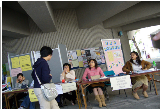
Students registering for lab visits