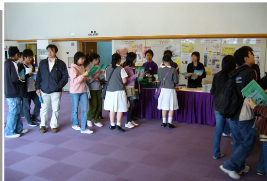
Students outside Sir Run Run Shaw Hall lobby