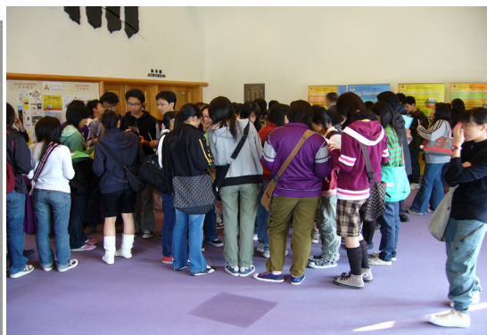
Students queuing up for faculty hand-outs