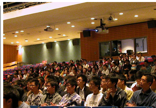
Inside Sir Run Run Shaw Hall