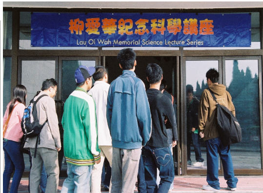
Opening Hour at Sir Run Run Shaw Hall

The 1st Lau Oi Wah Memorial Science Lecture Series was held on Saturday 19 November 2005 in SRRSH from 9:30 a.m. to 4:45 p.m. Highlights of the event as follows: