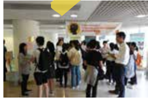
Orientation Day for Undergraduate Admissions