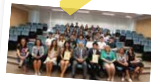
Spanish Award Presentation Ceremony