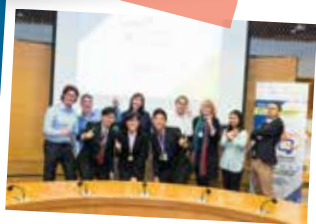
German Language Olympic