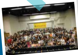
French Music Festival