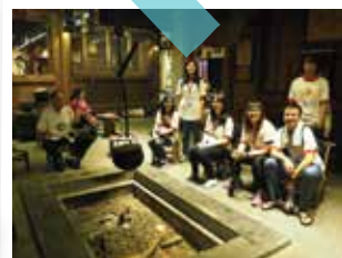
Cultural Trip to Chongqing