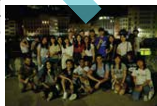
Summer Overseas Study