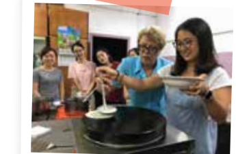
Summer Trip to Russia