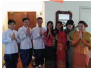
Activity of Thai Class