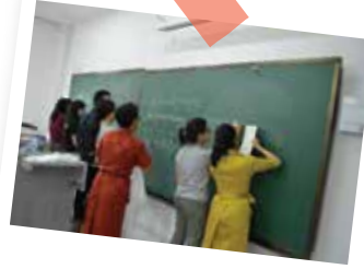
Field Trip on Tibetan Language