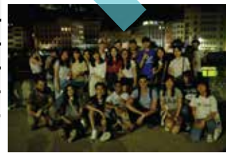
Summer Overseas Study