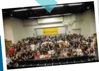
French Music Festival