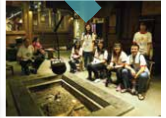
Cultural Trip to Chongqing