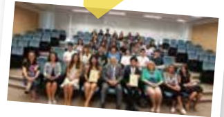
Spanish Award Presentation Ceremony