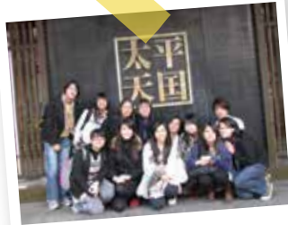
Field Trip to Shanghai