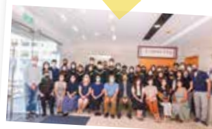
Undergraduate Photo Taking