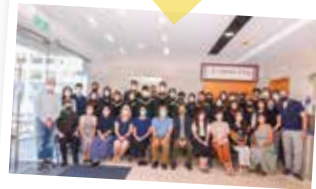
Undergraduate Photo Taking