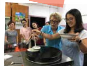
Summer Trip to Russia