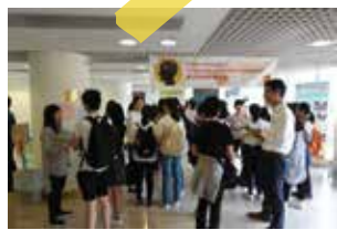
Orientation Day for Undergraduate Admissions