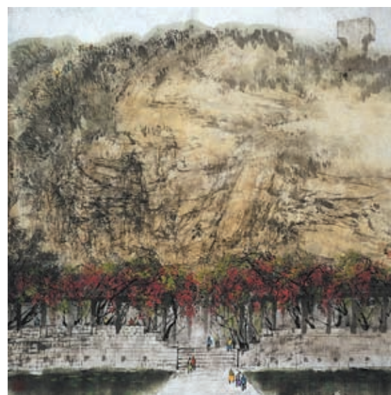
畫家王明明筆下的石坡 The rock face portrayed in a painting by Wang Mingming

Starting from 2006, the entire stability improvement project comprises three phases. The stretch