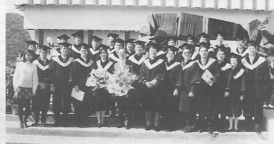
The first Executive MBAs