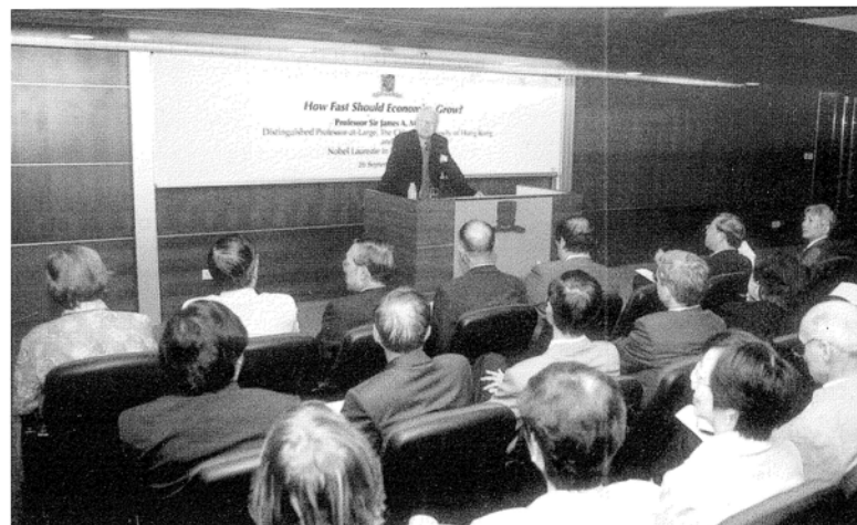
Prof. Mirrlees delivering a lecture on 'How Fast Should Economies Grow' after the reception

As Distinguished Professor-at-Large, Prof. Mirrlees will spend four months in a year at the University lecturing, guiding research, and promoting academic development.