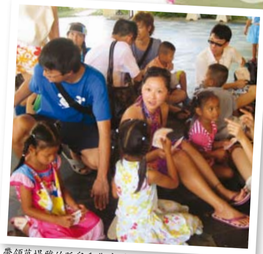
帶領芭提雅的孤兒和街童到水上樂園遊玩 Fun in the water at Pattaya Park with orphans and street kids

believe that whole-person education has advanced and diversified their personal development.