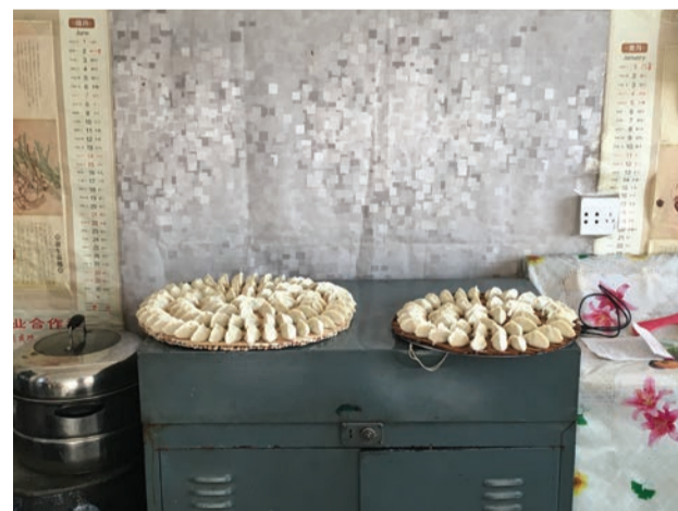
移民於城市的臨時家園室內一瞥 Inside a migrant's temporary home in a city

同教授認為人口遷移研究最困難之處，是資料的缺乏，因為很難在大型資料庫中追蹤遷移的人口。她最近的研究皆採用2010年推出的中國家庭追蹤調查資料。