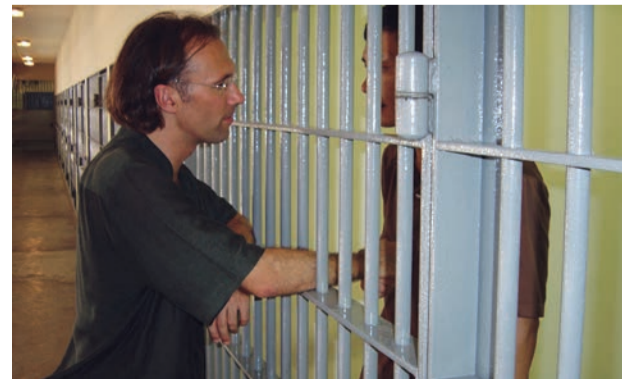
在石壁監獄看望囚友 Visiting inmates in Shek Pik Prison