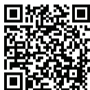
Scan to read the result