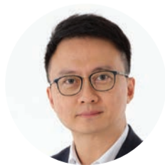
醫學院院長陳家亮教授 （〈「上醫醫人」：先盡己任才能為社會臻更大理想〉， 《香港家書》，香港電台，2020年1月4日）

「跨學科可突破每個學科的限 制，是未來研究主流， 惟目前本港協助將成果轉化成 商品的企業不多，現時多與內地 或國際企業合作。」