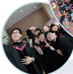
Graduation Photo Day 畢業生拍照日