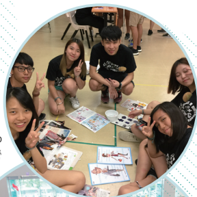
Student Orientation Camp 學生迎新營