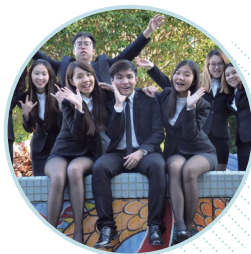
Student Society 學生會

本院鼓勵學生積極參與校內校外的課外活動，讓他們能夠盡展潛能，發揮無窮創意，從而達致均衡的全人發展。