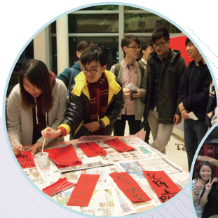
Spring Dinner 春茗

學生將到不同的機構參與社區健康促進計劃的制定、實施和評估。學生須在導師督導下完成二百二十小時的實習工作，並從中得到於社區中和各式社區人士一起工作的寶貴經驗。