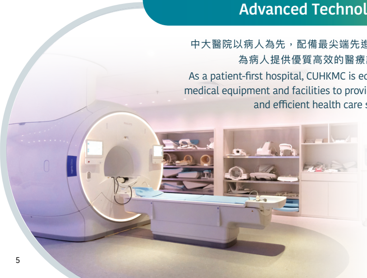
◀ 磁力共振造影 Magnetic Resonance Imaging

As a patient-first hospital, CUHKMC is equipped with the latest medical equipment and facilities to provide patients with quality and efficient health care services.