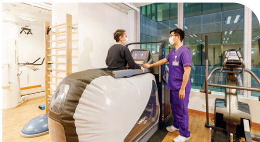
▲ 反重力跑步機 Anti-Gravity Treadmill

Managed by a multidisciplinary team (consisting of specialist doctors and physiotherapists), the centre provides one-stop assessment, diagnosis, treatment and rehabilitative services for clients with sports injury or other musculoskeletal / neurological conditions. The centre serves both inpatients and outpatients for their rehabilitative needs. The CUHK Medical Clinic - Physiotherapy Centre in Tsim Sha Tsui also provides a continuous rehabilitative support through a wide spectrum of physiotherapy interventions.