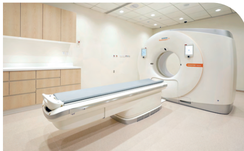
▲ 電腦掃描造影 Computed Tomography

Offers a host of imaging diagnostic services, including X-ray Imaging, Computed Tomography (CT), Magnetic Resonance Imaging (MRI), Ultrasonography, 3D Mammography, Bone Densitometry, Positron Emission Tomography with Computed Tomography (PET-CT), Nuclear Medicine Imaging and more.