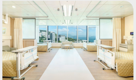
四人房 4-bed room