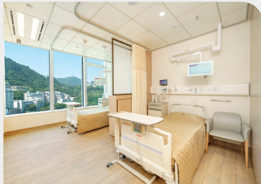
二人房 2-bed room