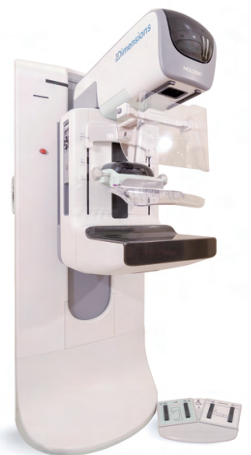
▲ 3D乳房造影 3D Mammography