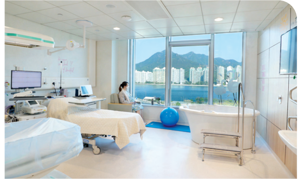
分娩室 Delivery Suite