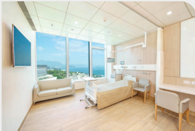
單人房 1-bed room