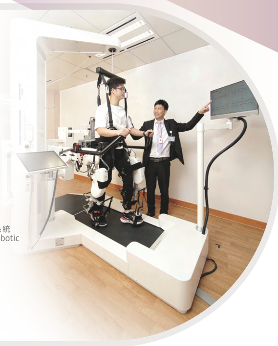
▶ 機械步態訓練系統 Lower Limb Robotic Gait Training