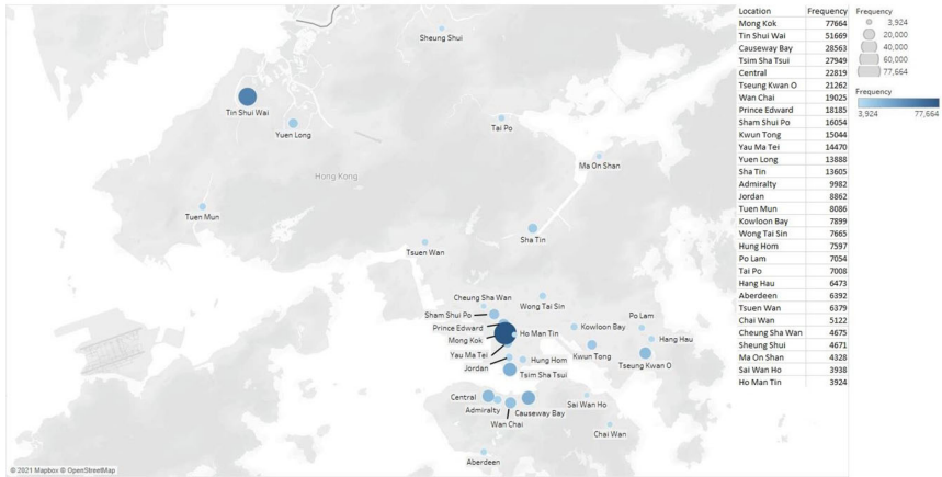
Figure 1. Map of the geolocation hashtags.

at least 50 times ( N=2,739 ), we identified five categories among these hashtags: (1) geolocations (particularly local regions and districts in Hong Kong), (2) movement slogans (e.g. #兄弟爬山—“brothers climbing a mountain”), (3) priming keywords in anti-ELAB (e.g. #黃色經濟圈—“yellow economic circle”—and #手足投稿—“contributions from brothers in arms”), (4) events (e.g. #毋忘721—“don’t forget 7/21”), and (5) mobilization (e.g. #文宣—“promotion”). According to Table 3, 15 of the 20 most frequently occurring hashtags were geolocations, a category that was prevalent across all extracted hashtags.