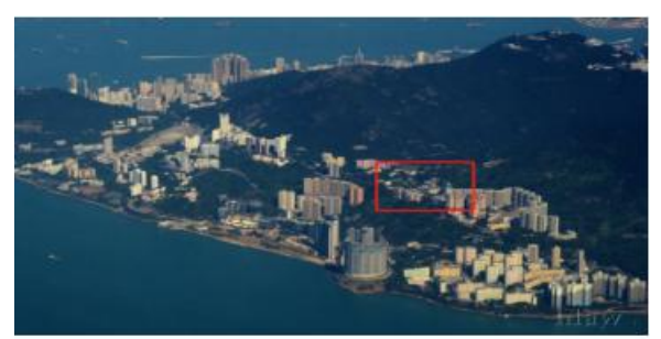
4.Sitting on the hillside, Pok Fu Lam village is in sharp contrast with the surrounding highly urbanized area.

1982. the In government introduced the Squatter Control Policy, which aimed at reducing the squatters. Under the instruction of this policy, a survey was conducted to record all the existing squatter structures. The owners of the surveyed squatter structures were not conferred any legal title to the land. Besides, theoretically, the existence of squatter structures is