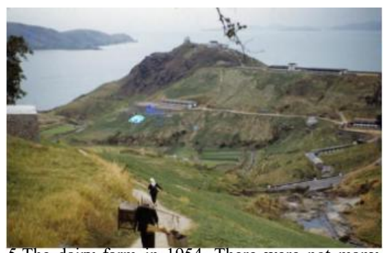
5. The dairy farm in 1954. There were not many houses in Pok Fu Lam Village at that time. Photo

As it mentioned above, the establishment of the dairy farm attracted a lot of people to settle in Pok Fu Lam village. Founded in 1886, the Dairy Farm was built to meet with the British colonists' need for fresh milk. Originally, the Dairy Farm occupied a 120,000 sq ft mountainous area in Pok Fu Lam, which was officially granted to the Dairy Farm Company in 1910.<sup>9</sup> It was very suitable for Pok Fu Lam to be used as a dairy farm. Isolated by the surrounded mountains, Pok Fu Lam was a