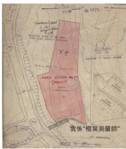
the road if the company insist to 6.The Conditions of Exchange No. 5979 clearly constructing a new vehicular access. shows the planned public stepped access (green However, re-design the road is far from an zone). easy thing. As it have been mentioned in the former paragraphs, Pok Fu Lam village has already become a much denser and larger squatter area than it used to be in 1956. A several of narrow footpaths are served as the main interchanges among the whole village. Not to mention the steep mountainous terrain of this site, it is quite hard for

One of the difficulties lies in the road construction plan is the location of the contemplated road. The layout plan No. L.H. 10/5 which was stipulated in 1956, only indicated the location of a public stepped access which was planned to be build by the government under the land grant term SC 10. Since it was not yet decided which party was going to be responsible for the construction of the private vehicular access, granted under the term SC 20, by the time of the land grant. As a result, the layout plan No. L.H. 10/5 did not present the envisaged vehicular road. Therefore, it is necessary to re-design the road if the company insist to constructing a new vehicular access.