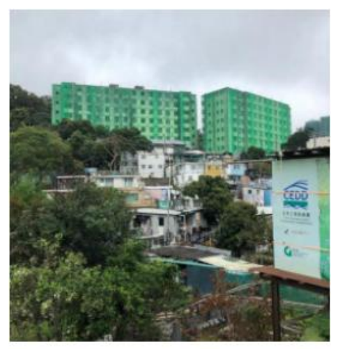
1. The two buildings covered in the green net are the former staff quarters. Obviously, they are land-locked by the surrounding squatter structures.

The Dairy Farm Company eventually won a lawsuit against the Director of Lands for nearly twenty years. This controversy was taken place in Pok Fu Lam village, one of the oldest and the last village in Hong Kong Island. Since 1910 the Dairy Farm Company, the plaintiff, has been granted a farm lot on the hill behind the village under the crown lease. Around 1956, Dairy Farm Company sought for an extended building area to build its staff quarters, as a result, the company exchanged a portion of its old lot for a smaller rural building lot under the government's approval. Among the land grant terms stipulated that time, there is a Special Conditions 20 (SC 20) suggests that "a right-of-way" from Pokfulam Road to the new lot should be given. However, due to the