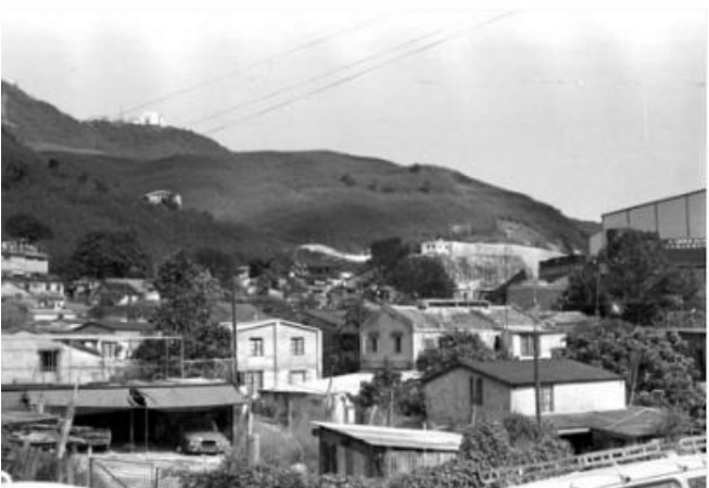
In addition, the Bethanie and 3. The Pok Fu Lam village in 1978. Photo by P. Y. Tang/ Nazareth Press were built nearby South China Morning Post via Getty Images.

After the British colonization the population in Pok Fu Lam village has gradually increased with the development of the Hong Kong Island. In the 1860s, in order to support the water supply to cater the explosive growth of the population in Hong Kong Island, the valley, west to Pok Fu Lam village, was constructed into the first reservoir in Hong Kong. In addition, the Bethanie and