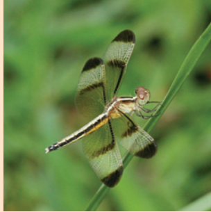
截斑脈蜻 Pied Percher ( Neurothemis tullia ) 蜻科 Libellulidae