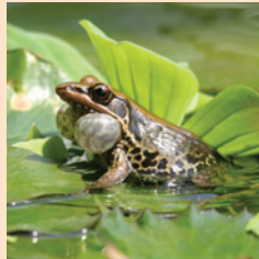
沼蛙 Gunther's Frog ( Hylarana guentheri ) 赤蛙科 Raniidae