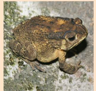
黑眶蟾蜍 Asian Common Toad ( Duttaphrynus melanostictus ) 蟾蜍科 Bufonidae