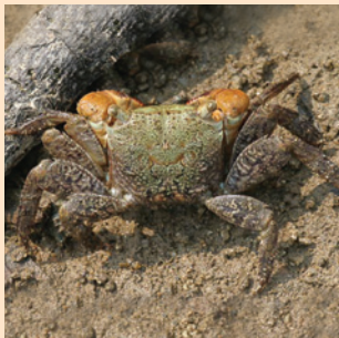
雙齒近相手蟹 Sesarminine Crab ( Perisesarma bidens )