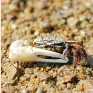
清白招潮蟹 Fiddler Crab ( Uca lactea )