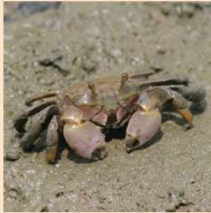
淡水泥蟹 Ocypodid Crab ( Ilyoplax sp. )