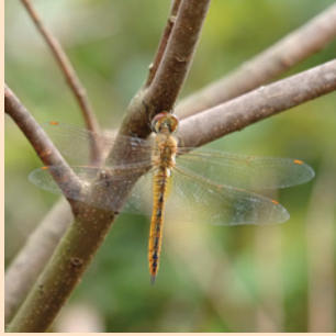
黃蜻 Wandering Glider ( Pantala flavescens ) 蜻科 Libellulidae