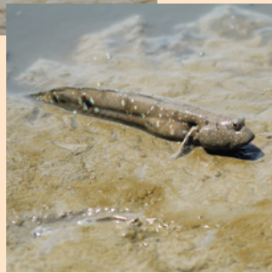
大彈塗魚 Bluespotted Mudskipper ( Boleophthalmus pectinirostris )