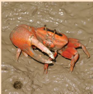
弧邊招潮蟹 Fiddler Crab ( Uca arcuata ) 沙蟹科 Ocypodidae