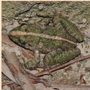
澤蛙 Paddy Frog ( Fejervarya limnocharis ) 赤蛙科 Raniidae