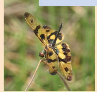
斑麗翅蜻 Variegated Flutterer ( Rhythemis variegata ) 蜻科 Libellulidae