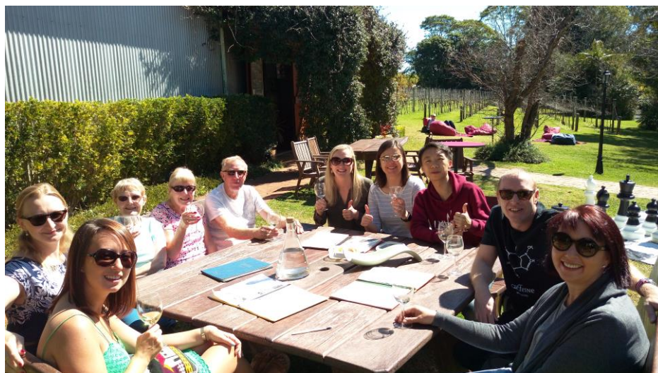
Having lunch with my boss and partners from another city