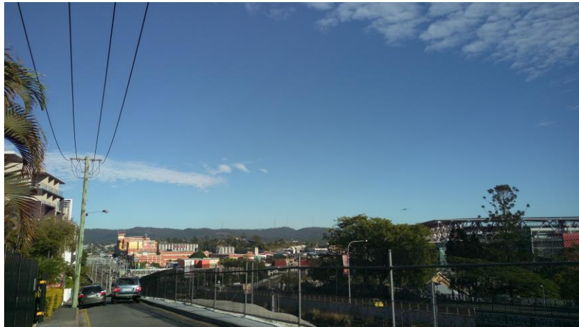
Ardor Group was located at a mountain, giving one a glimpse of the beautiful view of the western part of the city.

Ardor Group, the company which I worked for as an intern, is located in Brisbane. It was a marketing company, primarily helping clients to promote their products and services. One of the unique marketing methods they used is face-to-face marketing.