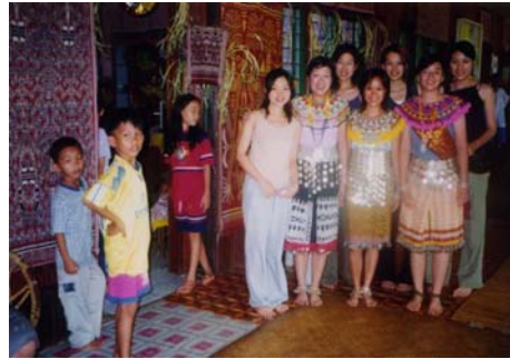
At Rumah Enting Iban Longhouse: some of our students put on Iban dress 在恩丁伊班長屋，同學穿上伊班族傳統服裝參與迎賓儀式