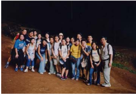
At Niah Cave 在尼亞山洞洞口

除了體驗當地文化，少不了參與學術研討的活動。例如出席由砂勞越華人文化協會和砂勞越發展機構安排的講座，瞭解詩巫華人的歷史和文化，以及砂勞越州馬來文化和回教的關係。會中同學積極發問和回應討論，獲益不淺。作為田野考察學習活動的一部份，同學還先後參觀了砂勞越博物館、古晉的貓博物館，以及民都魯區的動物園。