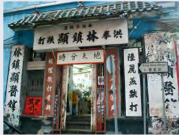
Field trip to Wan Chai