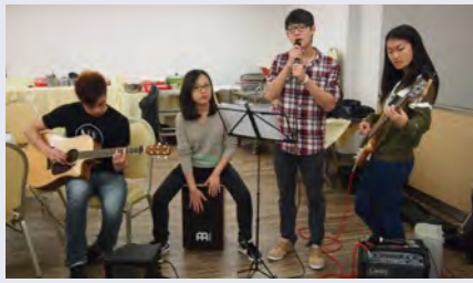
Music performance by students