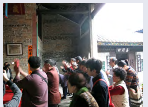
The Tang lineage's lantern-lighting ceremony held on the 12th of the first month of the lunar year (Kathy Chang 2015)