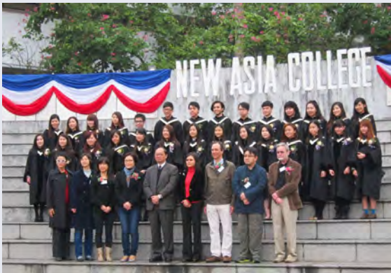
Graduating students and teachers at New Asia Concourse