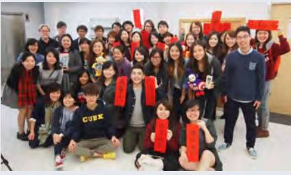
Lunar New Year Dinner 2015