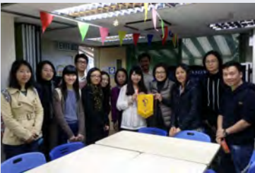
Visit to New Home Centre