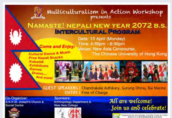
Poster of "Namaste! Nepali New Year 2072 B.S. Intercultural Program"