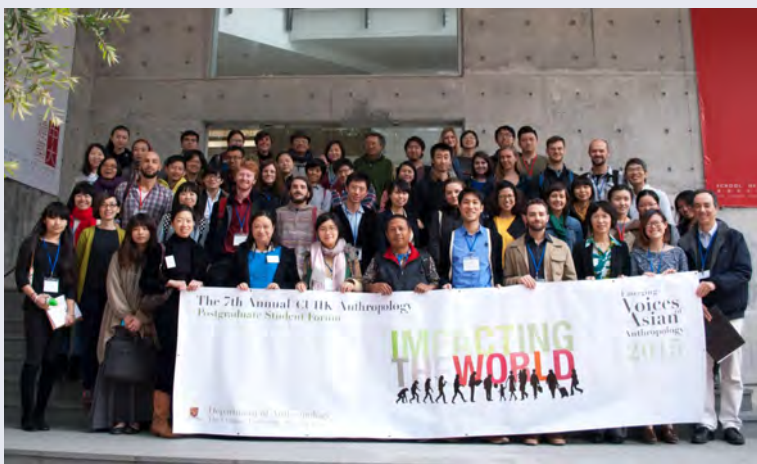
Participants of the 7th Anthropology Postgraduate Student Forum

Since 2009, the Department of Anthropology has organised an annual Postgraduate Student Forum to encourage academic exchanges among young anthropologists and other social scientists studying Asia. This year's theme was "Impacting the World: The Emerging Voices of Asian Anthropology".