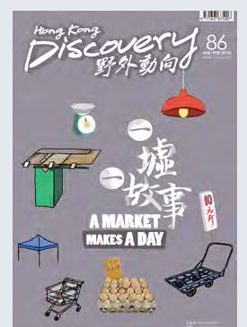
Cover page of Hong Kong Discovery , Vol.86

Click here to check where you can purchase the magazine.