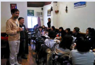
The Buddy Program kicked off in Jordan