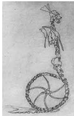
Remedios Varo, On Homo rodans (1959)