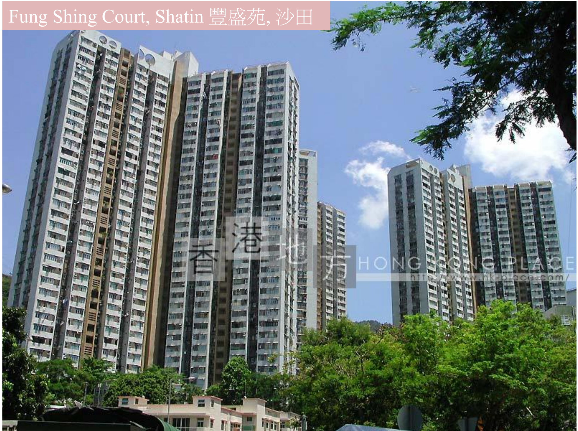
Fung Shing Court, Shatin 豐盛苑, 沙田