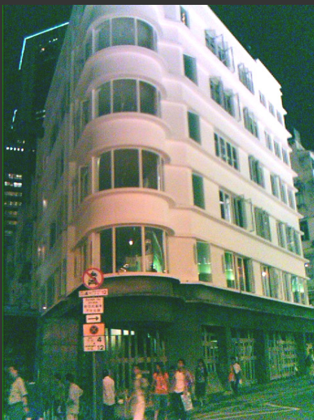
Old Chinese building 唐樓