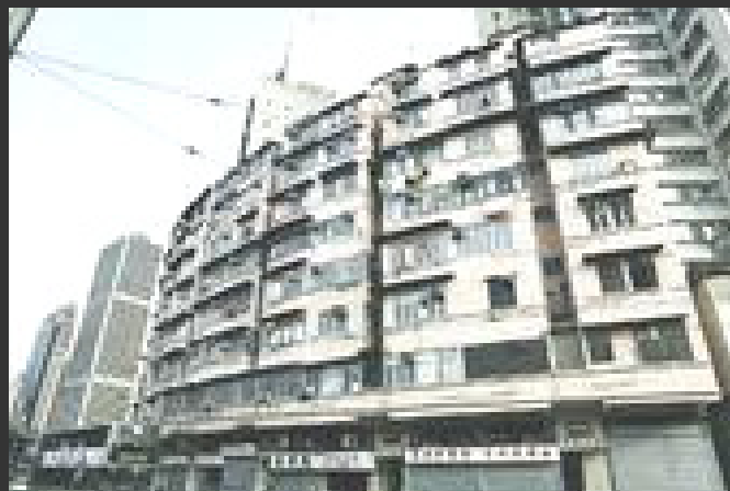
Old style mansion 舊式大廈