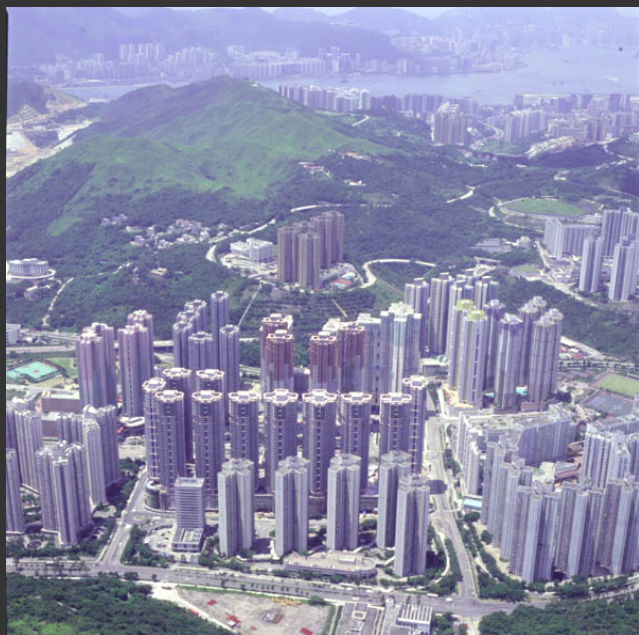
New private housing estate (Tseung Kwan O, Kowloon East)