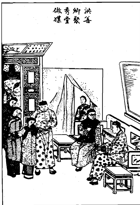
BENEVOLENCE, HAMLET AND SIMPLICITY go visiting at the Hall of Beauties.

the miniature hookah and filled the pipe for them.