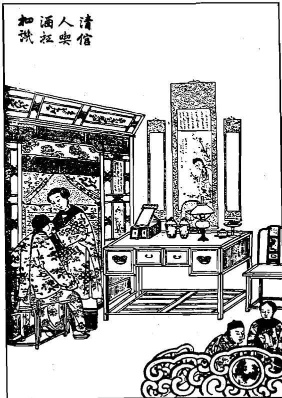
HAMLET AND SIMPLICITY are entertained by Jewel.

Jewel broke in, "What about it? Don't virgin courtesans have drinking parties too?"