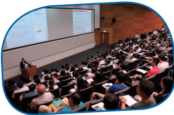
Seminar: Implementing STEM Education in Science Classes