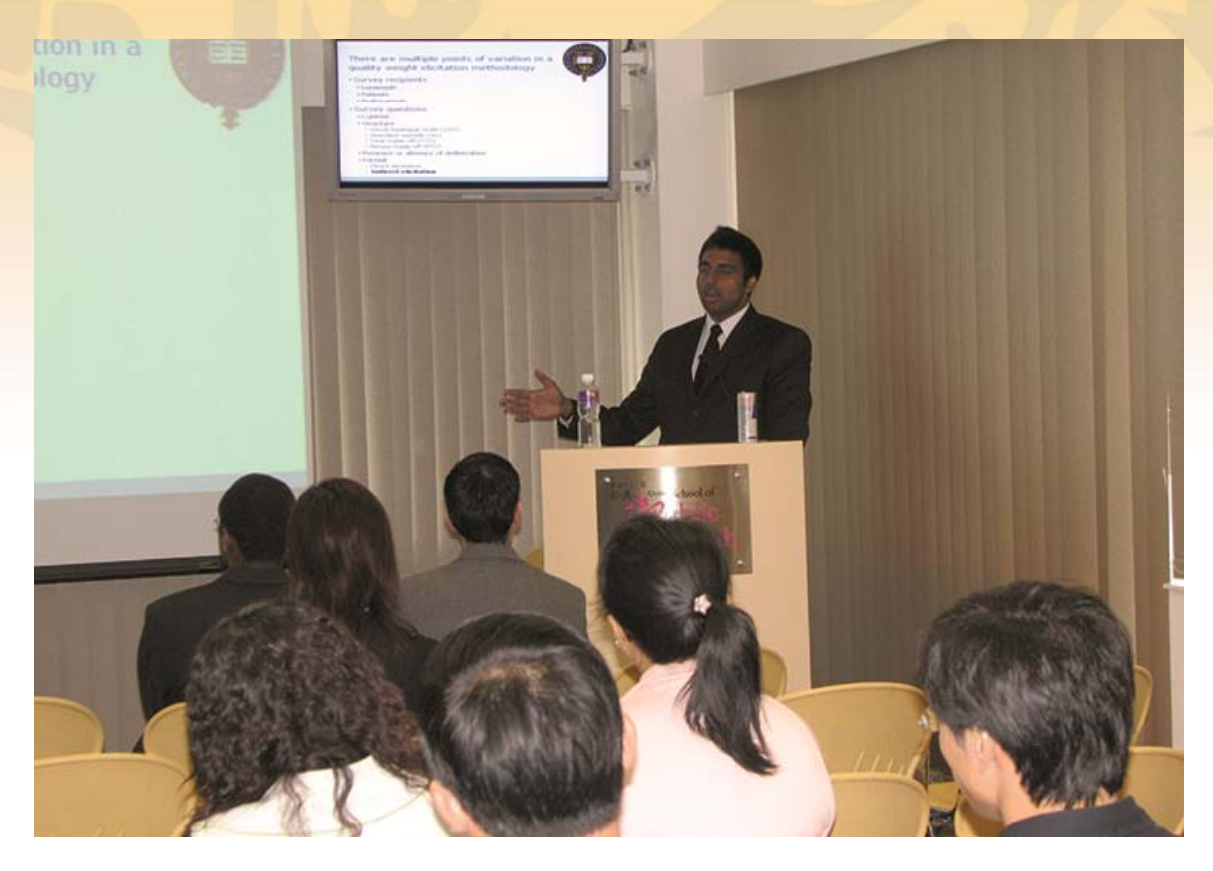
英國、加拿大交換生在中大發表演說 Presentation by Research Placement Students from the UK and Canada