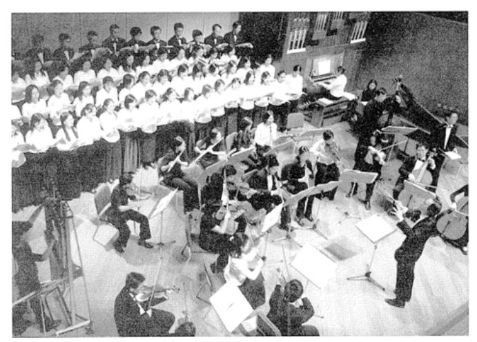
Top: The spacious lobby Middle: One of the four lecture halls Bottom: Trial performance in the world-class concert hall

Situated on the ground floor of the teaching block is a spacious curved lobby with modern fittings and glass curtain walls, which can be used as an exhibition hall. The four lecture halls and classrooms are extremely advanced, all being installed with audio-visual equipment including multi-purpose DVD and VCD players, VCRs, tape-recorders, CD players, and highbrightness LCD projectors. Computer cables are provided to allow teachers and students to use their portable computers and connect them to the University's servers or the Internet, while the latest CEN-TRAV system (with a user-friendly mini central remote control