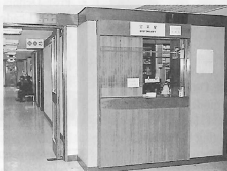
Dispensary and the centre's landmark corridor