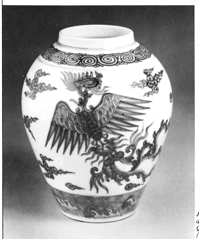
Jar with underglaze blue decoration of phoenixes, Qing, Qianlong (Gift of Bei Shan Tang)