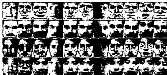
Fig. 3. Snapshot of cropped Yale database

Second experiment is performed on Yale face database from Yale University. The images are gray-scale and are cropped to a resolution of 116 \times 136 pixels. The database contains 165 images, including 15 distinct people, each with 11 images that vary in both expression and lighting. A snapshot of 4 individuals in the database is shown in Figure 3. The result of FRCM on Yale database to classify the 15 people under different conditions is given in Table 3.