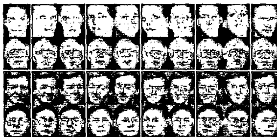
Fig. 2. Snapshot of ORL database

First experiment is performed on the ORL face database from AT&T Laboratories Cambridge. The images are gray-scale with a resolution of 92 \times 112 pixels. The database contains 400 images, including 40 distinct people, each with