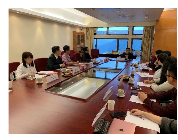
Delegation of the Department of Political Science, National Cheng Kung University from Taiwan