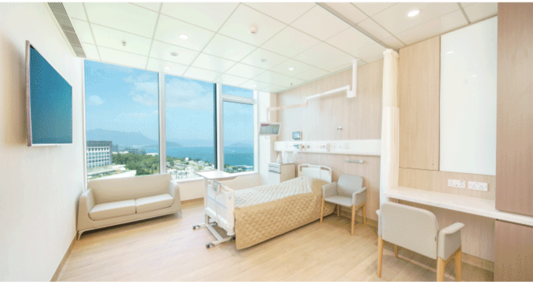
一人房 1-bed room