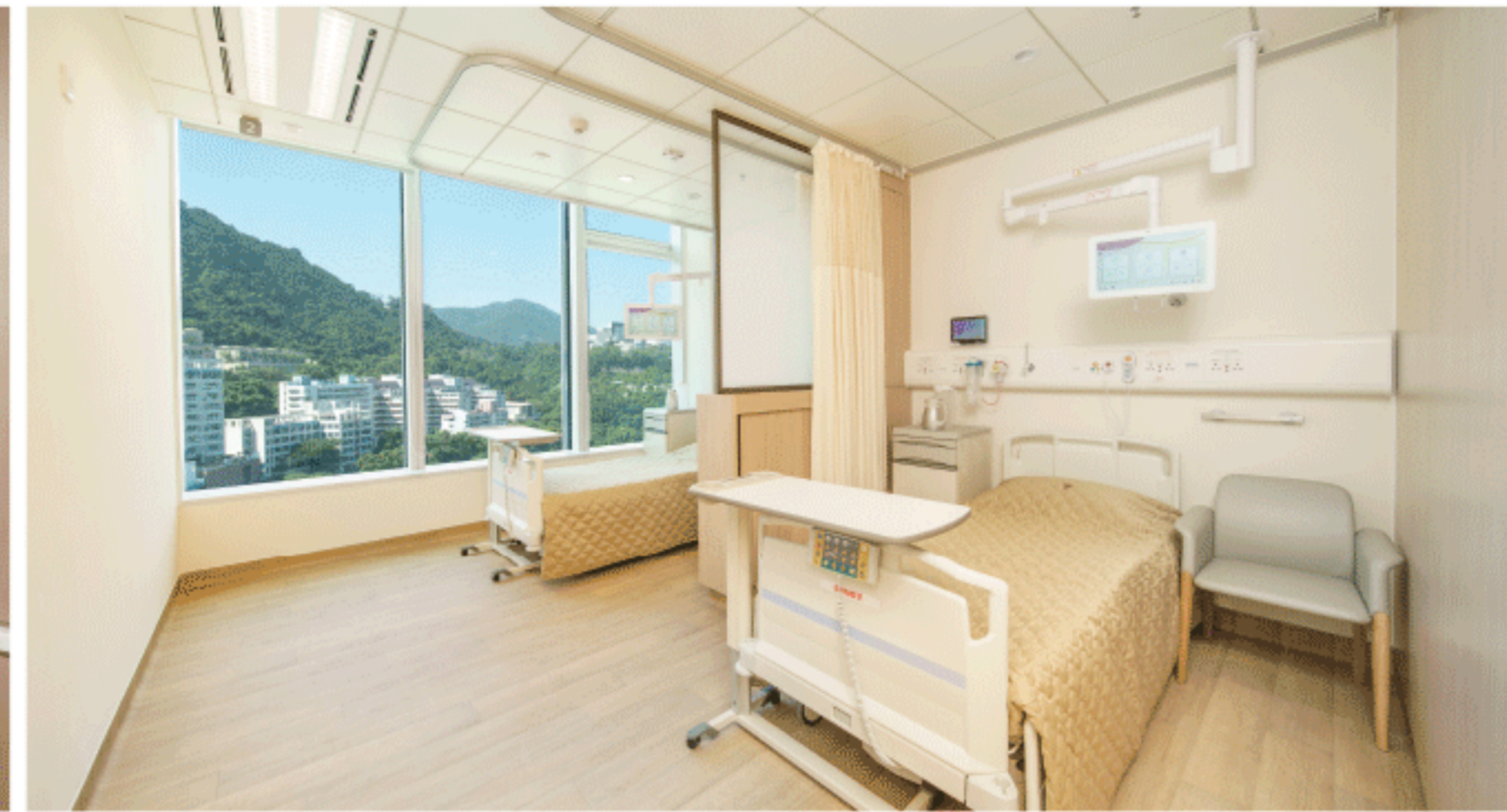
二人房 2-bed room