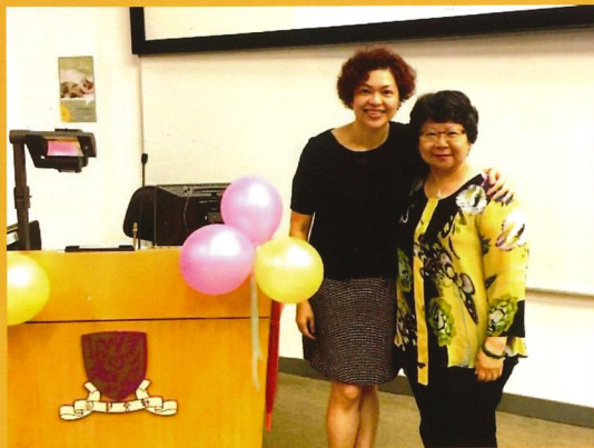
It was certainly a wonderful partnership between YY1 and CUHK.