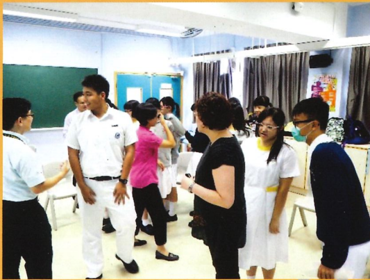
Students and teachers playing an ice-breaking game.