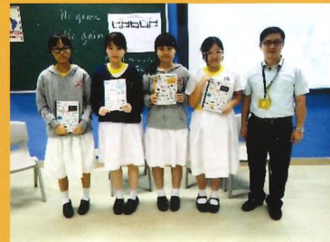
One of the best teams!