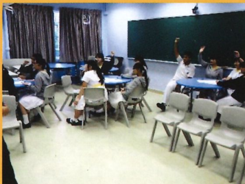
Active participation throughout!