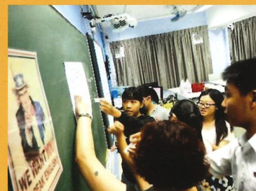
All focused on the game!