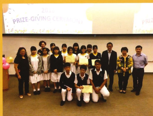
It was a wonderful learning opportunity for our students.