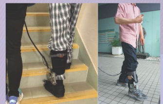
Walking on stairs

The Hong Kong Jockey Club Charities Trust has supported CUHK to launch a three-year project "CUHK Jockey Club HOPE 4 Care Programme" to implement four evidence-based advanced rehabilitation technologies in 40 local elderly day care centres and rehabilitation centres, to benefit the community.