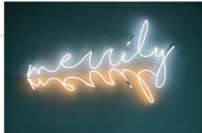
LO Lai Lai Natalia (2017 MFA)

學術興趣： 中國人物繪畫創作及理論研究、中國畫色彩與媒介研究 Research Interests: Chinese figure painting; Chinese painting colors and media