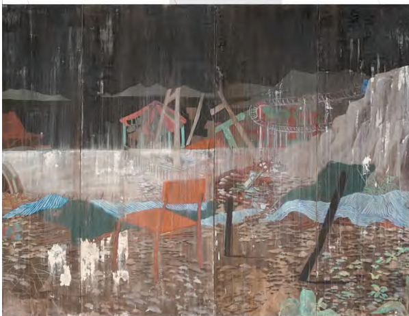
WONG Sze Wai (2020 MFA)

本系於七十年代因應社會和大學整體發展需要，訂定學科和術科兼備的課程發展方向。1981年，設立藝術史碩士課程，邀請饒宗頤先生為榮譽教授，親自指導研究生。1992年，增設中國藝術史哲學博士課程，集中於書法繪畫、古代器物、中國現代藝術之研究。1993年，開辦藝術碩士（藝術創作）課程，成為香港首個頒授藝術創作碩士學位的學系，並於2009年開設兼讀制文學碩士課程，務求為香港培育更多藝術人才。