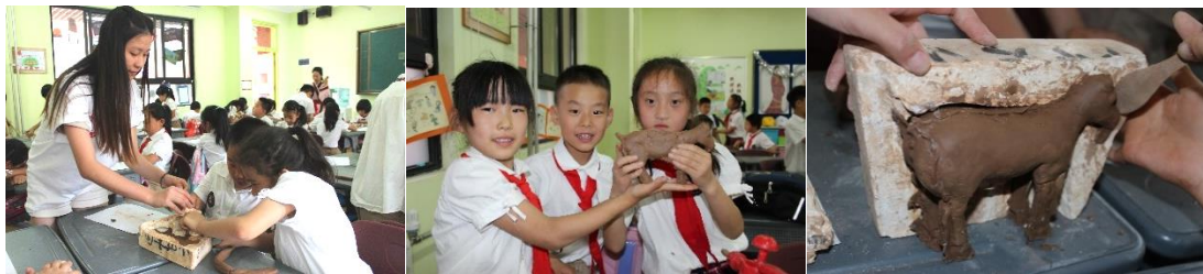
Teaching the children how to make a pottery figure