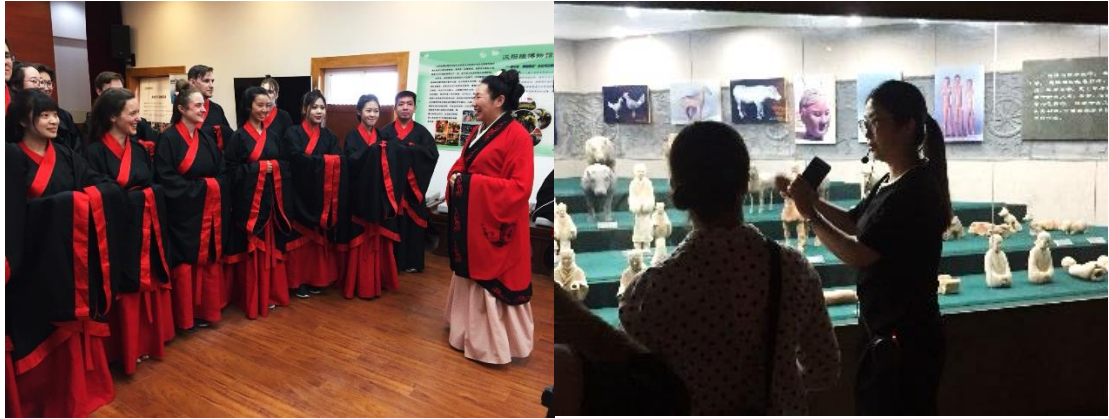
Han Culture Experience Day