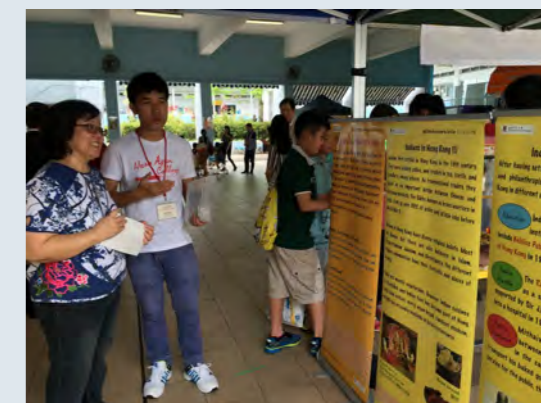
Our exhibition docents at work