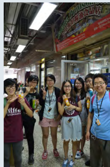
Visiting a Pakistani grocery in Kwai Chung