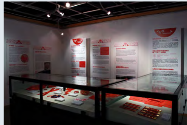
The exhibition was held from 17 October 2016 to 28 October 2016.

The exhibitions showed how wedding rituals have changed over time, and illustrated how anthropologists can study a simple custom to learn more about a society and culture more broadly.