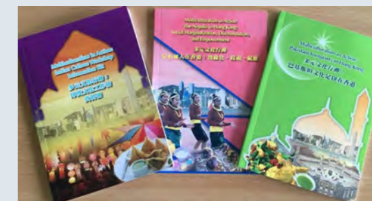
Information Kits published by MIA