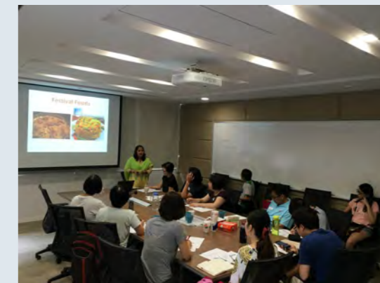
A Bangladeshi nutritionist giving a seminar on Bangladeshi food culture