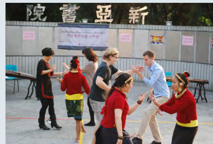
Celebrating Nepali New Year on campus

Since 2016, a community outreach program “ FUN with Inteculturalism ” (sponsored by the Equal Opportunities Commission) has been launched to promote messages of multiculturalism to various local communities. Over 30 Chinese and South Asian youth have been trained as docents for the Exhibition on South Asian Communities in Hong Kong, and as helpers to assist the kabaddi (a South Asian sport) hands-on program. Feedback on this program shows that learning and experiencing culture first-hand is the best way to debunk myths and break down stereotypes.