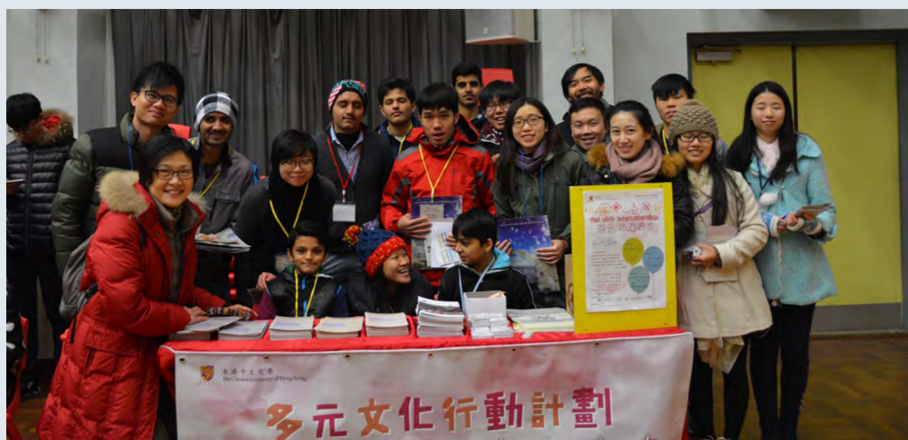
MIA participating in a community event

Also, in this semester, a documentary on MIA and South Asian communities in Hong Kong is being produced. It will be premiered in February 2017. Stay tuned!