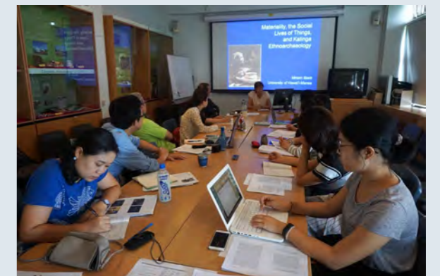
The one-day workshop

Angkor's first great king, Jayavarman II, established Cambodia Angkorian state on the banks of the Tonle Sap in 802 CE and built his first capital, Mahendraparvata, on the slope of the nearby Kulen mountains. What followed were six centuries of political competition, warfare, and imperial rule by Angkor's kings. Like rulers of other ancient states, Khmer kings built vast stone monuments to honor their predecessors and gods that still stand today. A century of scholarly research on the Khmer empire's achievements has shed light on the scale and nature of premodern Southeast Asia's most influential polity; it has also shaped political agenda in unanticipated ways. The lecture visited such accounts and myths and explored how archaeological research offers another strategy for imagining Angkor: its rise, its splendor, and its collapse and regeneration over two millennia.