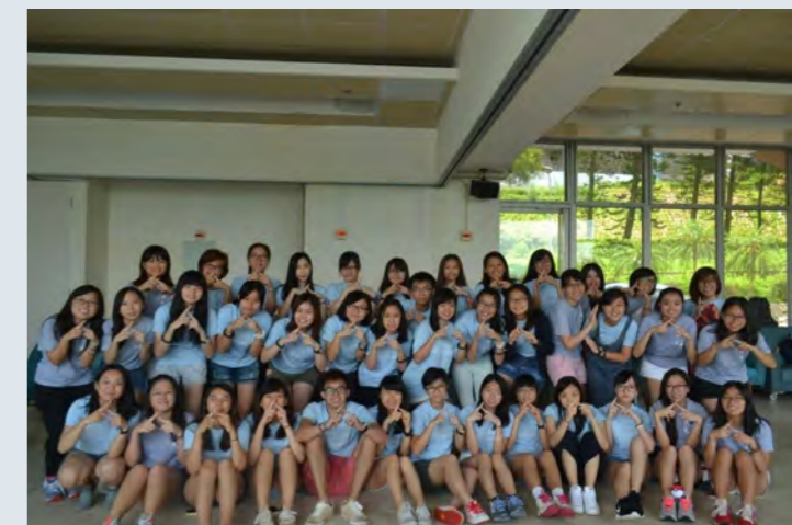
Group photo taken at the Orientation Camp

The Orientation Night and Orientation Camp organized for incoming freshmen of the department were held on 12 August and 17–20 August. During the Orientation Night, Anthroorigin, the 2015/16 Undergraduate Student Society, organized various games for the freshmen to help them break the ice.