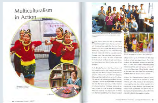
Chinese University Bulletin No.2 2015

Funded by the Knowledge Transfer Project Fund (KPF), MIA turns academic research into knowledge accessible to the public. Since 2013, MIA has organized workshops on Indian , Nepali , Pakistani , Bangladeshi and Sri Lankan cultures. These workshops pioneer a two-tier model in intercultural education. In the first tier, post-secondary students are trained to be Cultural Trainers through seminars and field trips that involve speakers from South Asian communities. After learning different aspects of South Asian cultures, the Cultural Trainers are guided in developing community-based projects together with ethnic minority youth, which are presented in secondary schools and universities, accompanied by the Exhibition on South Asian Communities and a South Asian sports hands-on program.