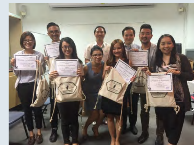
Graduates of our department coming back to share with our students their work experience

The purpose of the Mentorship Programme is to enhance the connection between alumni and undergraduate students, so that the latter can learn from the alumni's social and work experience, especially on how to apply anthropological knowledge in different job situations and career paths.