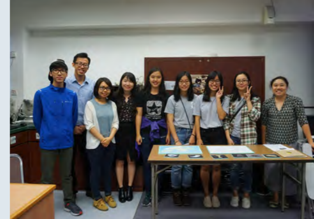
The Archaeology Team