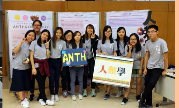
Student helpers stationing at the Esther Lee Building