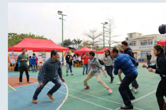
Audience of different ethnic origins enjoying kabaddi