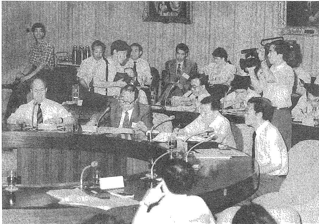
The conference is getting reading to work!

An international conference on "Relations between China and Taiwan in 1990s" was held at the CUHK on July 15-16, 1992. This two-day conference, co-organized by the Programme, Hong Kong Taiwan Chamber of Commerce, 21st Century Foundation (Taiwan) and Society of Taiwan Studies (Beijing), brought together some sixty scholars from Mainland China, Taiwan and Hong Kong who held thorough discussions about the relations between China and Taiwan.