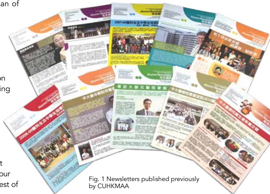
Fig. 1 Newsletters published previously by CUHKMAA