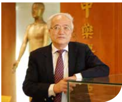
Information Services Office, CUHK