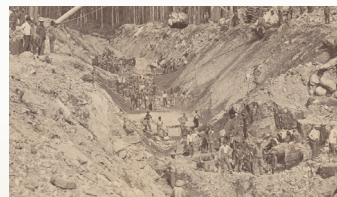
1 1800s Asian Migration & Exclusion