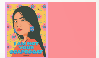
4 Modern Immigration from Asia & Today's AA Communities