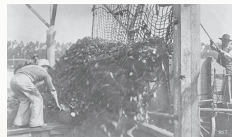
2 Early Asian American Activism