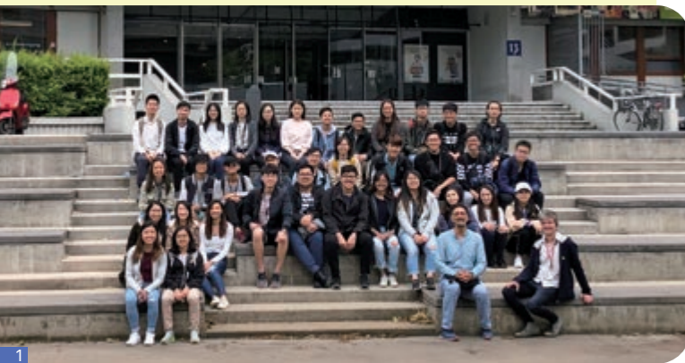
Field trip to Amsterdam - Rotterdam, The Netherlands 荷蘭阿姆斯特丹 - 鹿特丹實地考察