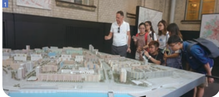
Field trip to Berlin, Germany 德國柏林實地考察

本課程提供一系列的海外實地考察，讓學生前往不同的考察地點，包括美國、中國大陸、德國、新加坡、台灣、希臘、南韓、越南和荷蘭等，感受多元化的城市形態和社會結構，明白城市研究對了解這個千變萬化的世界底意義。透過實地考察，學生與來自不同大學的教授和學生、從業者和政策制訂者互相交流，了解周圍環境（再）發展的問題和解決方案，開拓國際視野，並把相關經驗帶回香港。