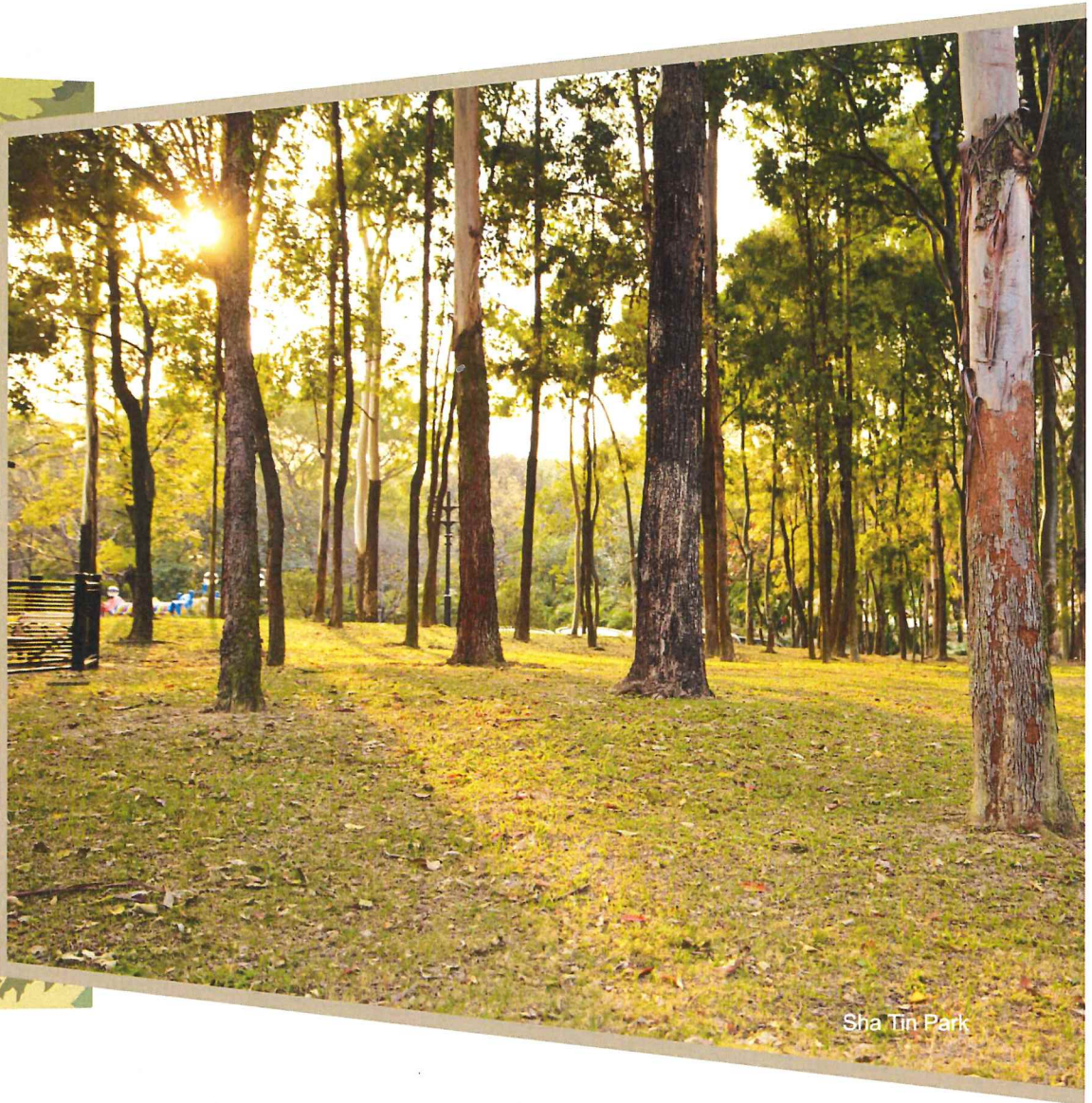
Sha Tin Park