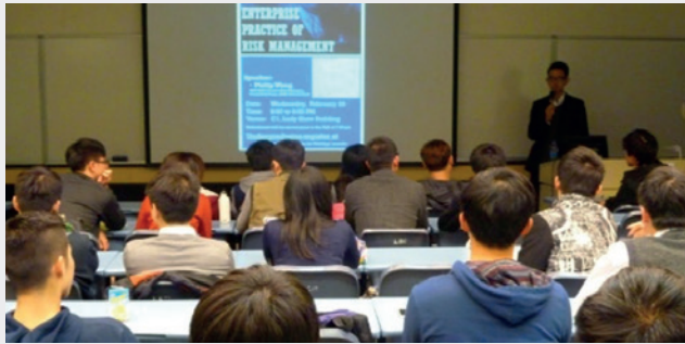
Alumni Talks and Professional Sharing Sessions

Our programme offers students a series of enrichment activities, such as alumni talks, professional sharing sessions and Bloomberg tutorial sessions. These activities support students' development as risk management professionals and encourage them to adapt to our ever-changing knowledge-based society.