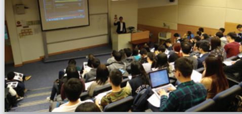
Bloomberg Tutorial Sessions

Our curriculum places special emphasis on the analytical and critical aspects of risk management. The core courses in the curriculum cover fundamental theories and pragmatic knowledge from a wide range of subjects in mathematics, statistics, finance, accounting, decision science and managerial economics. Our elective courses enable students to explore the advanced aspects of risk management, including stochastic calculus, statistical modelling and simulation methods for financial applications.