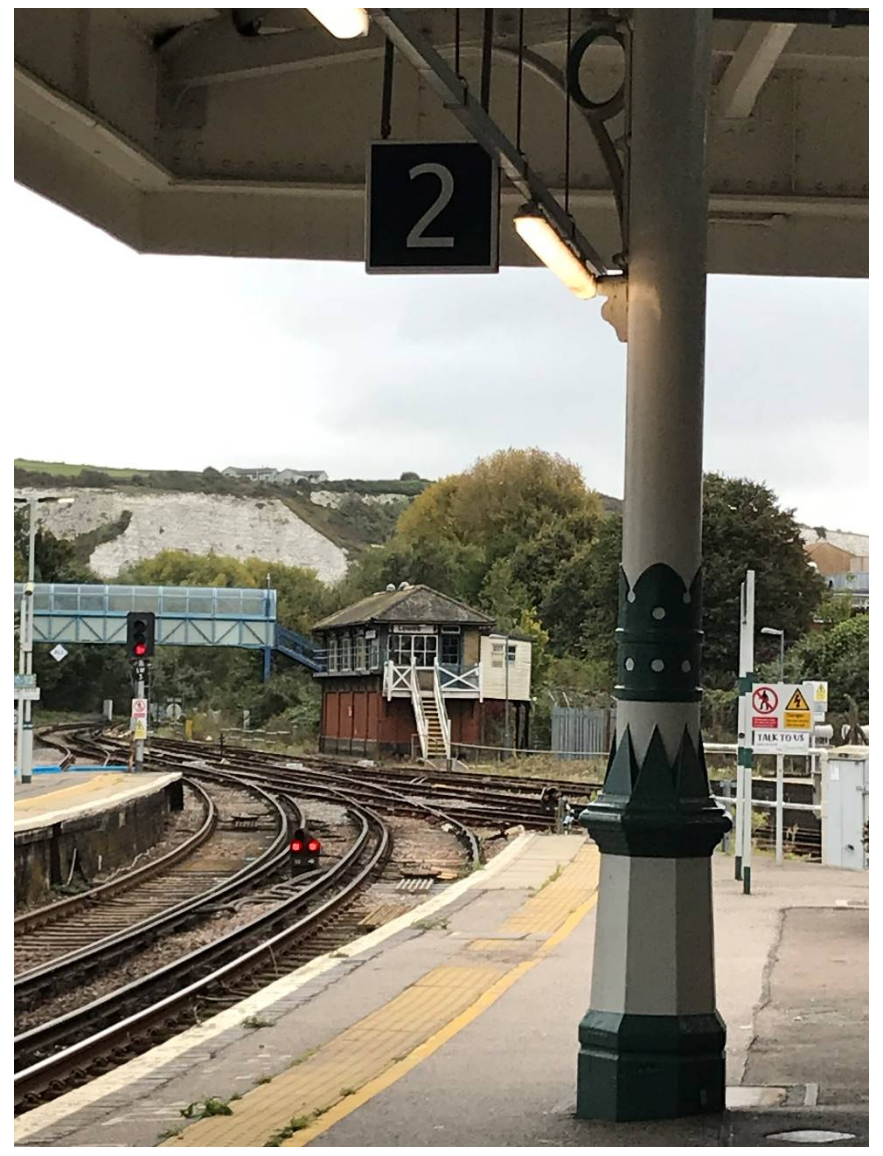
Being away from home is definitely a transformative experience

I thought about my own case. Coming from a Filipino household, LGBT issues were rarely brought up, and if they were, it was never in a positive light. In Hong Kong as well, most of my Chinese friends approach the issue quite conservatively. When I arrived here, LGBT culture seemed so strange and unfamiliar to me, yet I was able to accept it in the end – just like how I have accepted the cultural differences between Hong Kong and the Philippines throughout my life, such as the tendency to speak more bluntly in the Philippines compared to Hong Kong. It made me realise how the simple fact of having a hybrid identity made it easier for me to accept