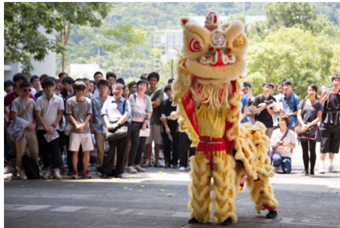
Students were treated to a lively lion dance at the Inauguration Ceremony on 10 September 2012.

On 23 August 2012, the Faculty welcomed students admitted to the new SCIENCE Programme with an Academic Counselling Session in LT6, Lee Shau Kee Building. This session was attended by approximately 400 students, and the talks