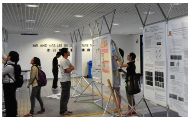
23 CUHK postgraduates attended this year's event.