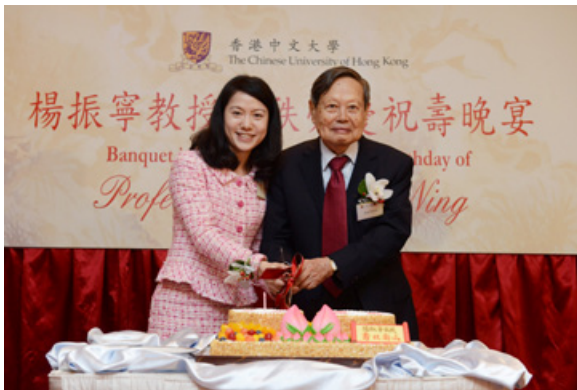
Prof. and Mrs. CN YANG at his birthday banquet