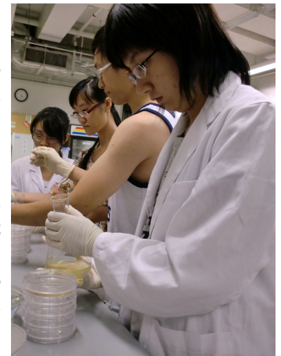
Developing bacteria in the laboratory.

bacterial plasmid DNA to store information of text, images, biological barcodes, etc. With this technology and its present standard, it is estimated that one gram of bacteria can store data up to 900,000 GB (Gigabytes) or 450 of 2 TB (Terabytes) hard drive of existing maximum capacity; it has great potential to other uses of data storage with encryption and decryption capabilities.