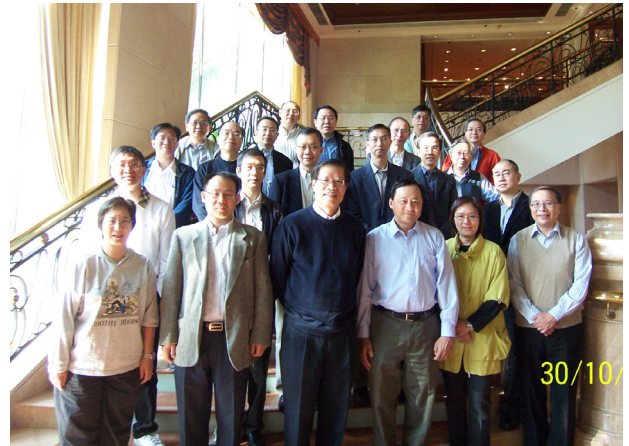
The Faculty Retreat 2010 was held successfully on 30 - 31 October.