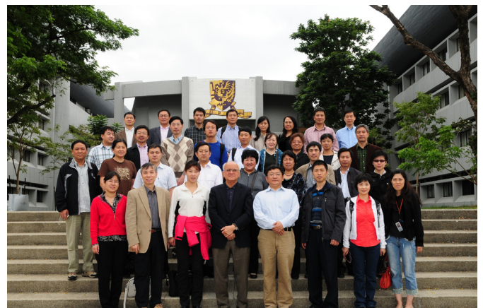
After the meeting, the CAU Delegation visited CUHK on 13 November 2010.