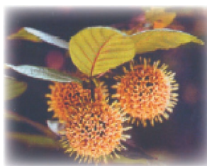
鈎藤 Uncaria hirsuta Haviland