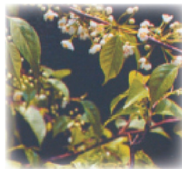
崗梅 Ilex asprella Champ.