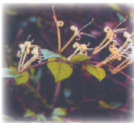
大花忍冬(金銀花) Lonicera macrantha DC.