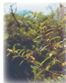
山芝麻 Helicteres angustifolia Linn.