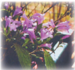
馬藍 Baphicacanthus cusia (Nees) Bremek

A total of 14 different kinds of chinese medicinal herbs was displayed at the Hong Kong Flower Show. There were: