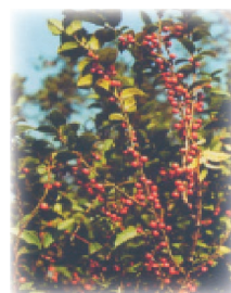
毛冬青 Ilex pubescens Hook. et Arn.

Each herb serves a distinct medical purpose for flu treatment. For more details, please visit: http://www.cuhk.edu.hk/scm/news/flower_show/leaflet.pdf