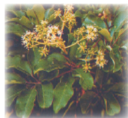
鴨腳木 Schefflera octophylla (Lour.) Harms