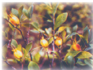
梔子 Gardenia jasminoides Ellis