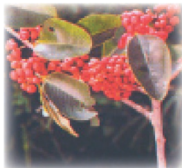
救必應 Ilex rotunda Thunb.