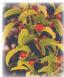
黃牛茶 Cratogeomys ligustrinum (Spach) Bl.