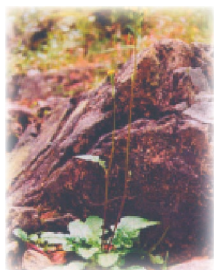
黃鵪菜 Youngia japonica (L.) DC.