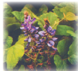
粉葛 Pueraria thomsonii Benth.