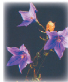
桔梗 Platycodon grandiflorum (Jacq.) A.DC.