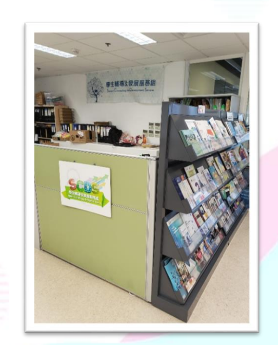
TKO Learning Centre