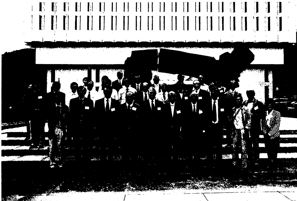
A group photo of participants at the International Conference on the Hong Kong SAR at Ten outside the University Library, 18 June 2007