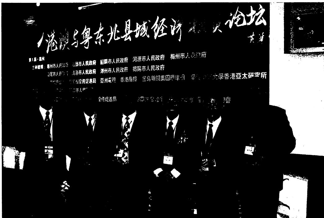
The main organizers of the Inaugural Forum on County-level Economic Investment in Eastern and Northern Guangdong with Hong Kong/Macao, 21 September 2006, Huizhou.