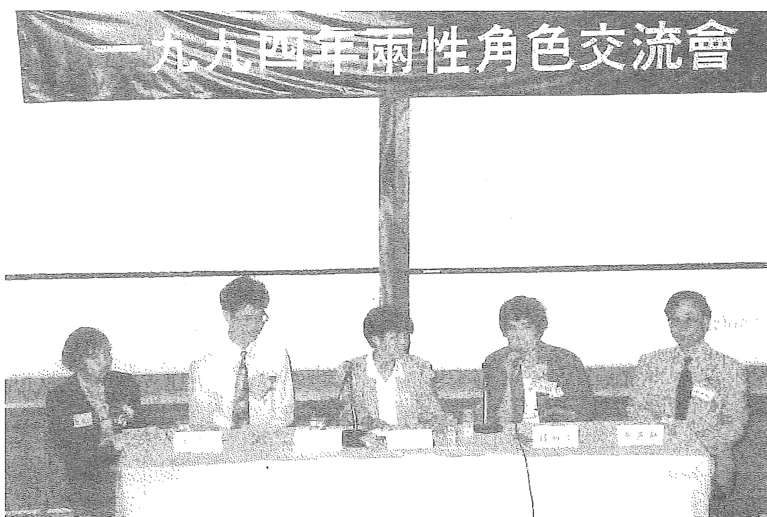
Gender Role Workshop '94 : "Little Women, Little Men - Gender Role Stereotypes and Conflicts in Development."

The workshop provided the opportunity for educators, parents, women's groups and academics to analyze the ways in which families and schools reinforce sexual stereotyping, and to explore ways as to how adults can provide an upbringing for their children in an environment without sexual discrimination.