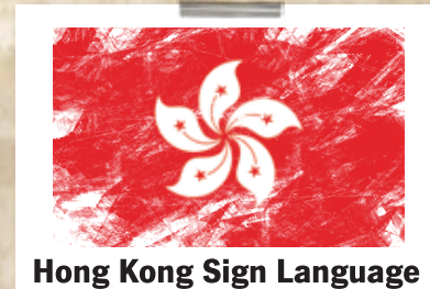
Hong Kong Sign Language