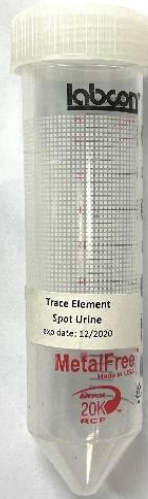
50 ml Spot Urine

Arsenic, Cadmium, Chromium, Cobalt, Copper, Iodine, Lead, Manganese, Mercury, Nickel, Zinc