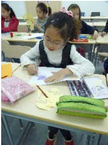
Students of “A Colourful World – Painting and Craft Studio” made a breakthrough of the traditional painting styles and used both painting and crafting techniques to create “Beautiful Tree”. The artwork had a rich texture.