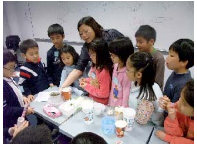
During the classes of “The Wisdom of Daily Life Sciences”, students planted green bean from seeds. They observed how the plants grew in each session and discussed what factors affecting their growth. Students all shared their views actively.