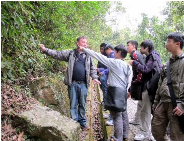
The instructor of “Open Country Tracing of Chinese Herbal Medicine” introduced basic Chinese medicine to students and took them to Tai Po Kau Special Area to identify common Hong Kong medicine herbs.