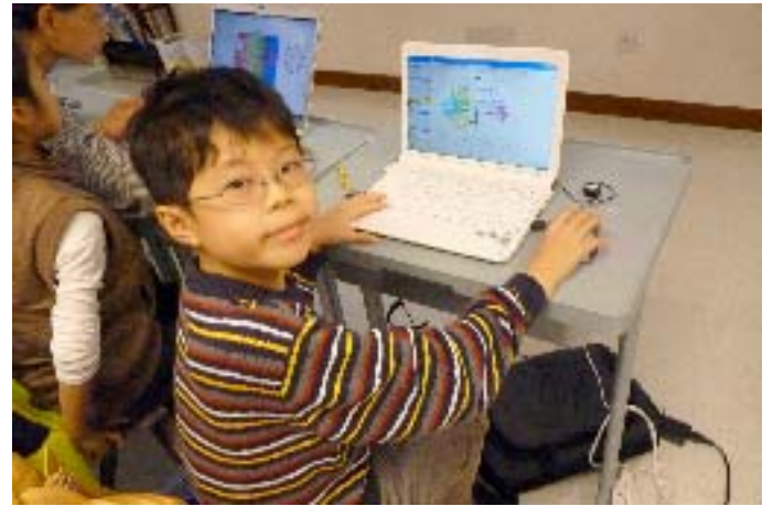
Students learnt to use computer software to create cartoon animals in the class of “Creative Digital Art Classroom – Digital Cartoon Creation for Beginners”. They also learnt the skills in creating animations. This student made a colorful and animated pinwheel.