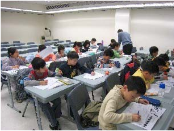
In the class of “Introduction to Mathematics Puzzles 2009”, students were seriously working on challenging mathematic problems. They were also trained to be more creative in problem solving.