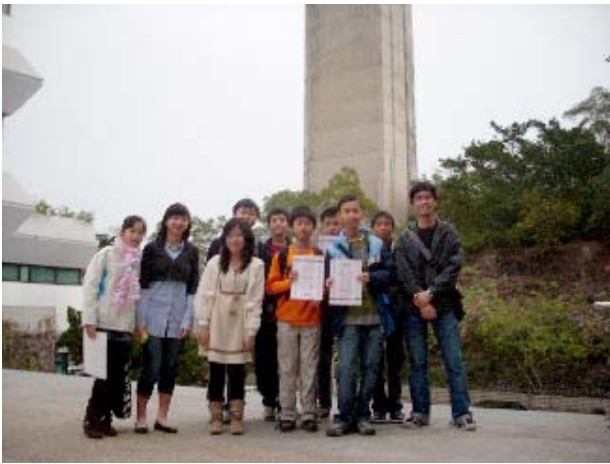
The instructor of “Introduction to Psychology” showed students the way to the world of psychology and helped them to understand themselves and others. They took a group photo in the CUHK campus after the course.