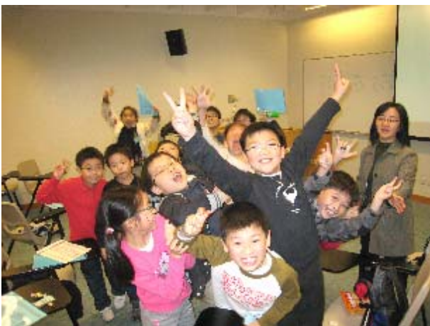
In “Managing Emotions”, students learnt and practiced how to manage their emotions effectively when they faced difficulties. After the course, students built-up friendship with each other and took a happy group photo.