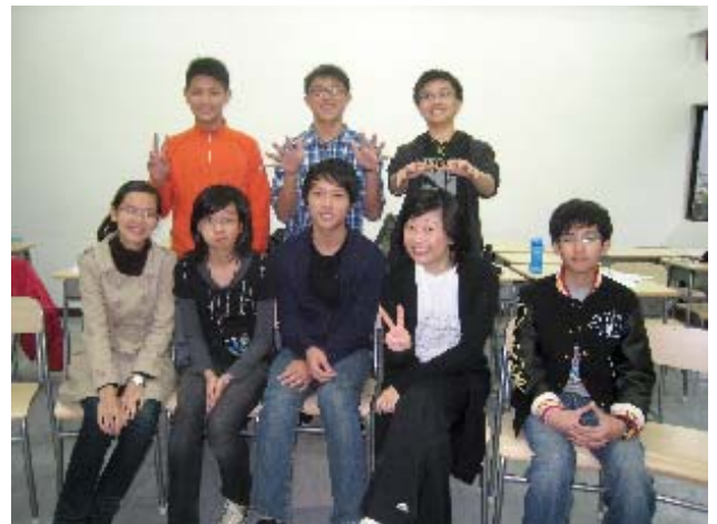
Students of “Presenting at Your Best” learnt to express themselves by using role identity, voices, intonation, facial expression and body languages. Their skills were properly trained through presenting stories, case analysis and public speaking exercises.