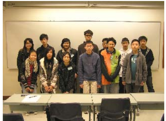
The instructor of “Economics Zone” used real-life cases and examples to introduce economic theories to the students, and let them experience how free market allocates resources efficiently.