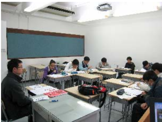
Different philosophical problems were discussed extensively in “The Philosophy Gym”. The course aimed to train students’ analyzing, thinking and expressive skills. In class, the instructor led students to analyze rationally the discussion topic. The skills they learnt in this course are useful in liberal studies.