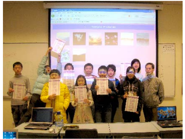
Students learnt web-page management, designing software and digital art in the course “Creative Digital Art Classroom – Web Gallery Design for Beginners”. Upon completion of the course, they were able to create their own web gallery!