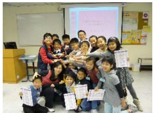
Students of “Painting an English World with Words” practiced their oral skills by simple cooking demonstration, mini drama and story presentation. They also showed their creativity through writing recipe, scripts, poems and stories.