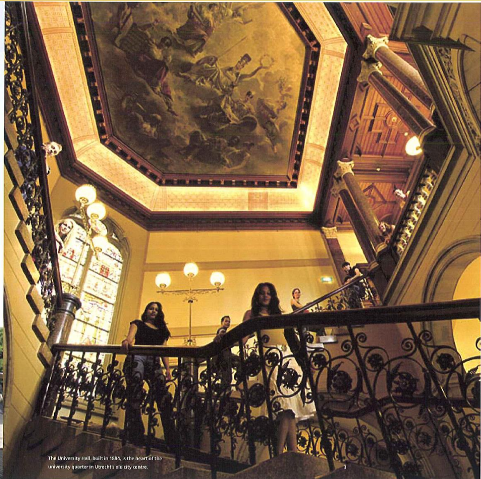
The University Hall, built in 1894, is the heart of the university quarter in Utrecht's old city centre.