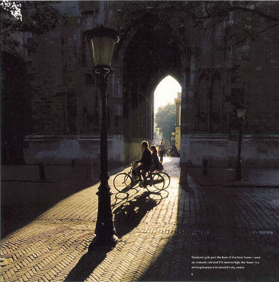
Students cycle past the foot of the Dom Tower – over six centuries old and 112 metres high, the tower is a striking landmark in Utrecht's city centre.