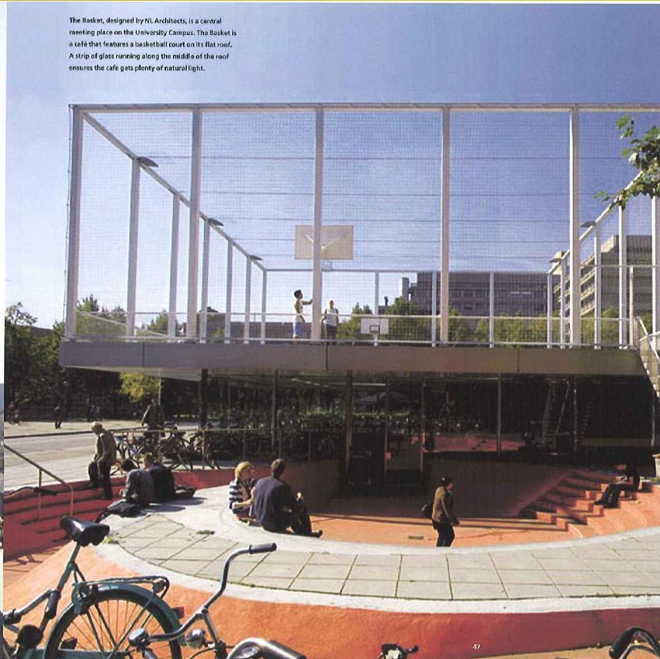
The Basket, designed by NI Architects, is a central meeting place on the University Campus. The Basket is a cafe that features a basketball court on its flat roof. A strip of glass running along the middle of the roof ensures the cafe gets plenty of natural light.