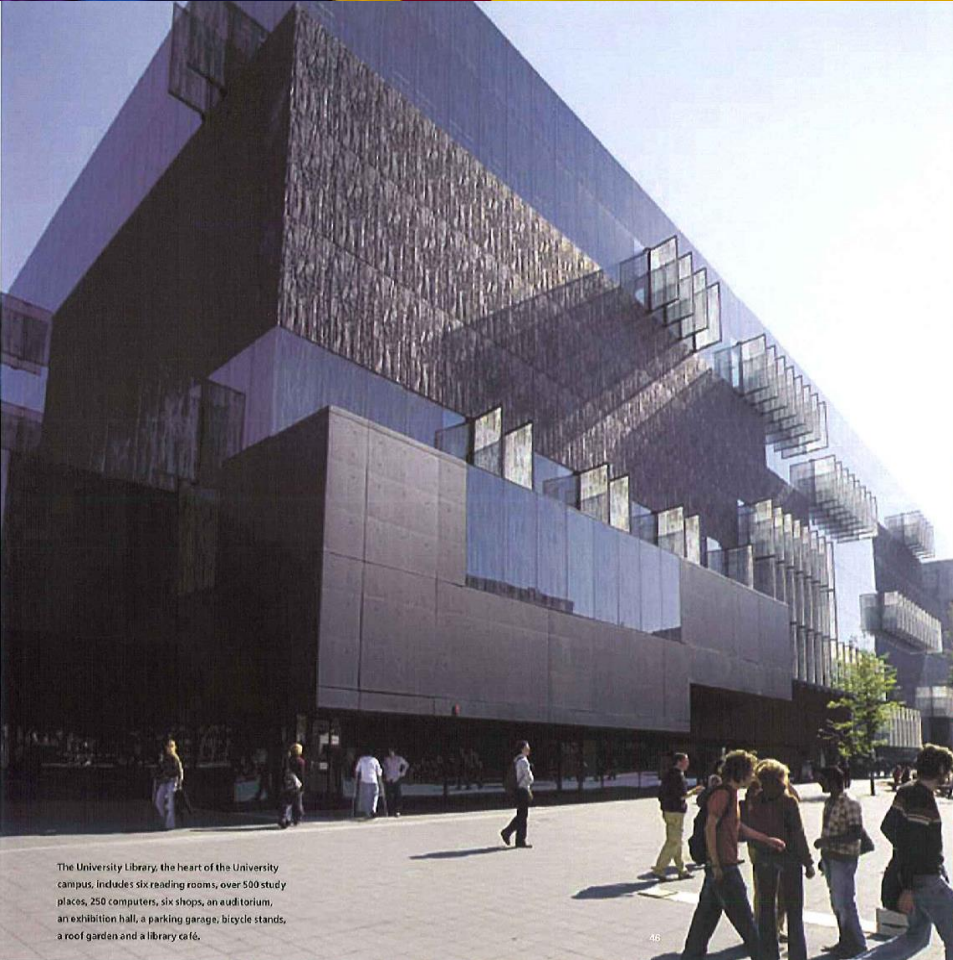
The University library, the heart of the University campus. Includes six reading rooms, over 500 study places, 250 computers, six shops, an auditorium, an exhibition hall, a parking garage, bicycle stands, a roof garden and a library cafe.