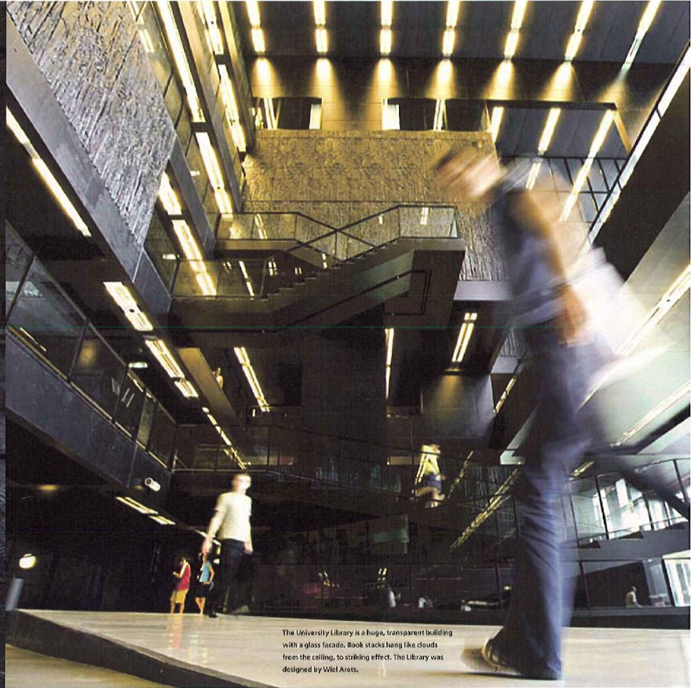
The University Library is a huge, transparent building with a glass facade. Book stacks hang like clouds from the ceiling, to striking effect. The Library was designed by Wiel Arets.